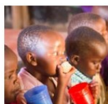
TOP PRIORITY! Emergency Food for Very Hungry Children

Continue to support the work of Grassroots by buying an alternative gift for a child, a family, a community or school