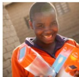
Safe Study Light