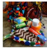
A Washing & Hygiene Pack